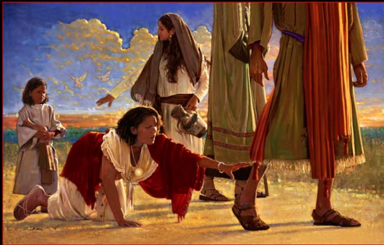
Divine Healing